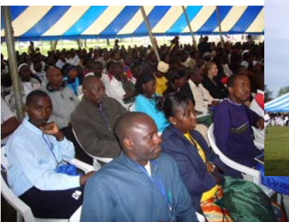
Inside the tent

Note: For more information on the Mobile Office Project, visit our website http://mygcx.org/mopub/