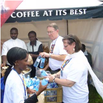
Helping serve water and food