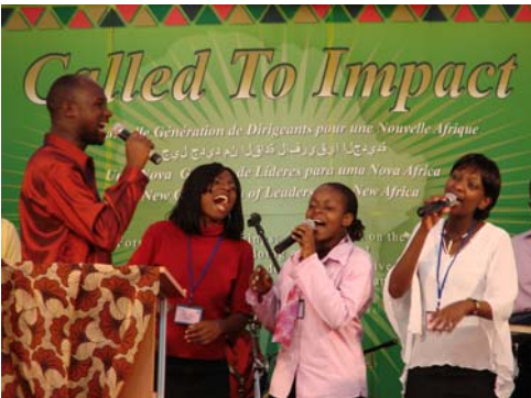
Music was an important part of each day