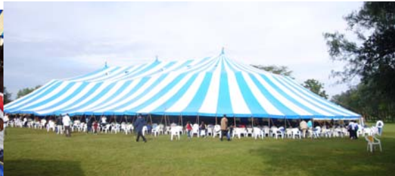
Meetings were held in a huge tent